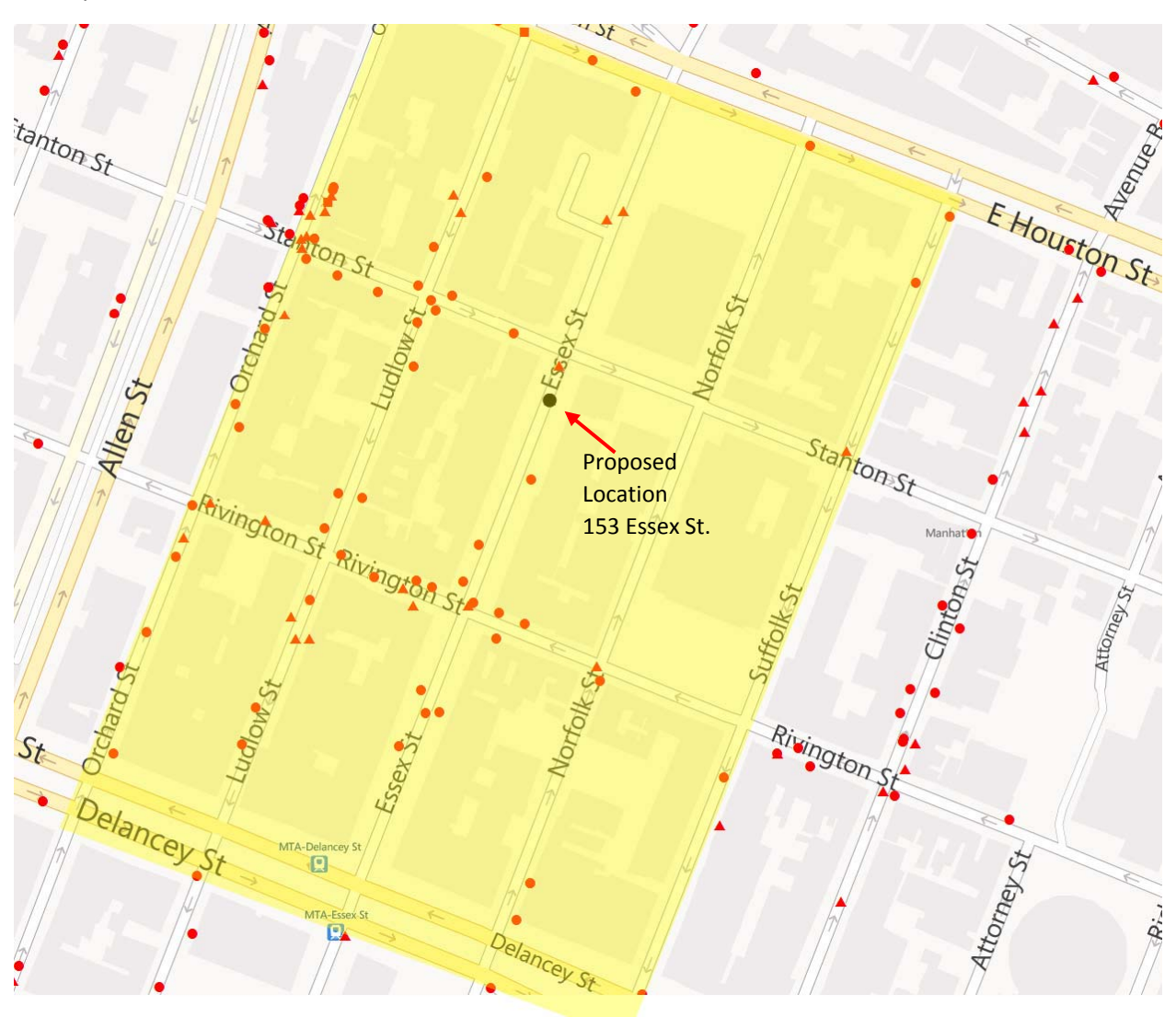
Legend – Triangles are Beer & Wine Only Licenses Circles are Beer, Wine, and Liquor Licenses

All on premises licenses within a 2 block radius